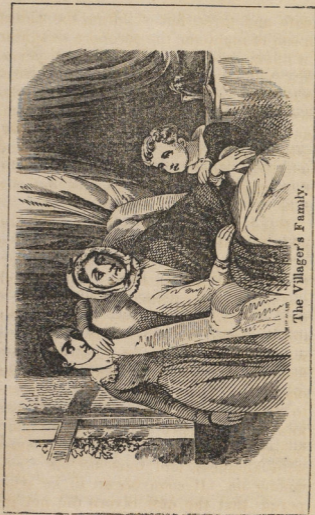
The Villager's Family.