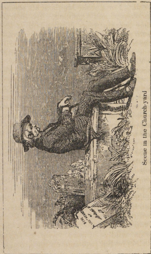
Scene in the Church-yard