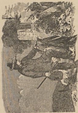
The Traveller's Return.