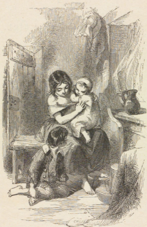
“She readily undertook the care of an infant and of the little ones left at home.”—PAGE 4