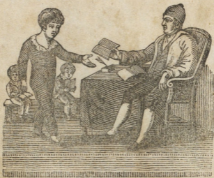
School-master and Boy.