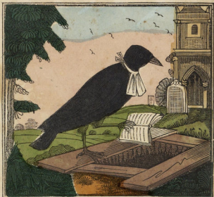
Illustration of a Rook