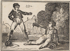
BATTLE OF THE BEACH. Page 14