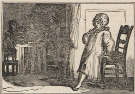
HUNGER AND OBSTINACY. Page 13.