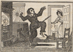
BURNT BY THE POKER. Page 19