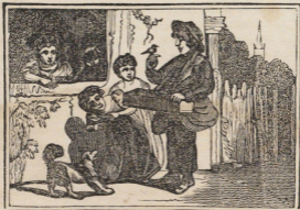
THE OLD PEDLAR.