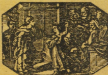
Christ disputing in the Temple.