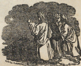
The wise men and the star in the East.